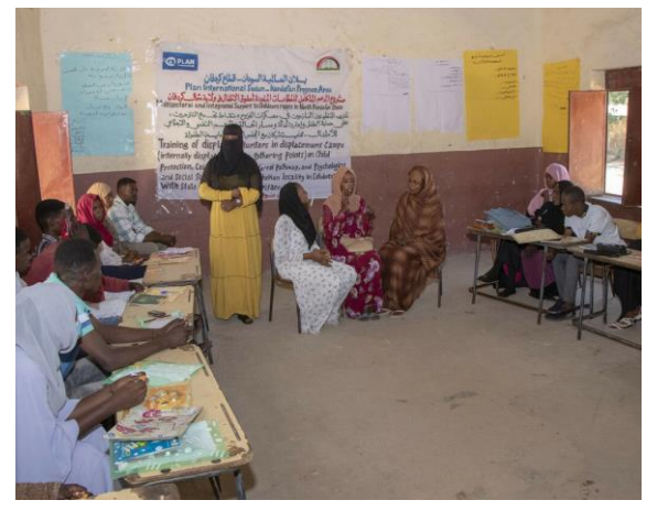
Parents meet to discuss child safety and education.

Plan is working with dedicated parents, teachers, school authorities and schools to make early childhood development a priority. While we are constructing temporary classrooms for accessible learning in emergencies, we are also rehabilitating 8 permanent classrooms for pre-school and primary students. 15 girls' education campaigns are underway, which includes fixing up 3 gender-inclusive latrines and installing clean water sources in 2 communities.