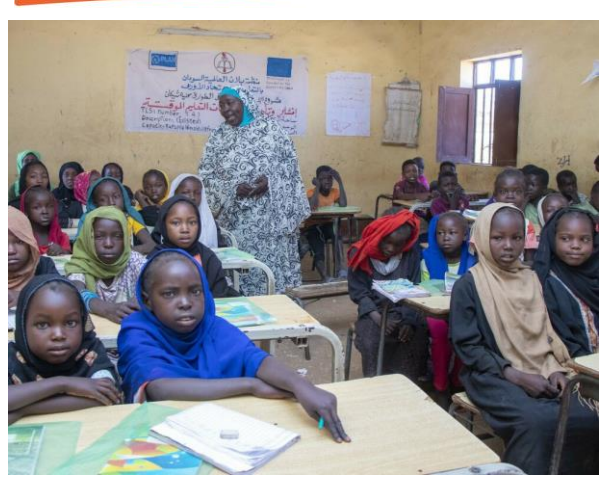
Children in a Temporary Learning Space in North Kordofan.