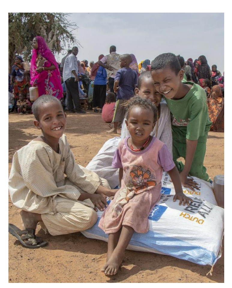
This year, 2,788 Sponsored Children received food aid.